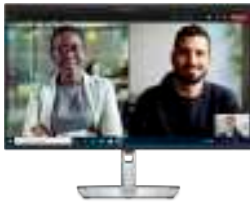
Dell 27 Monitor - P2723D

Create your ideal workspace with these recommended accessories.